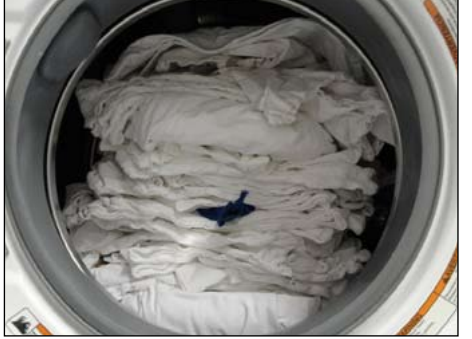
Fig. 2: The cotton bags are placed in the middle of the load without touching each other