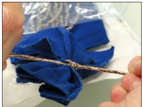
Fig. 1: Per test germ, 5 biomonitors are transferred into a blue cotton bag. The cotton bag is sealed.

3. The blue cotton bag is placed in the middle of the load and the washing process is fully processed.