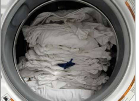
Fig. 2: The cotton bags are placed in the middle of the load without touching each other