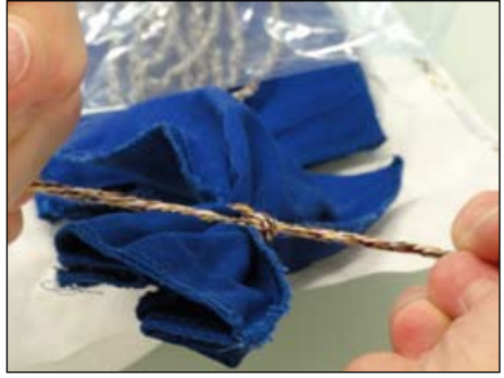
Fig. 1: Per test germ, 5 biomonitors are transferred into a blue cotton bag. The cotton bag is sealed.

3. The blue cotton bag is placed in the middle of the load and the washing process is fully processed.